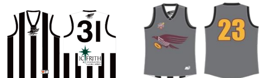
Payneham Norwood Union