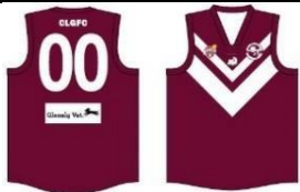
Colonel Light Gardens