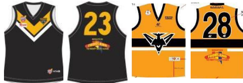
Brighton Districts & Old Scholars