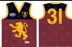
SMOSH West Lakes