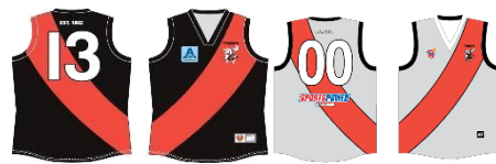
Tea Tree Gully