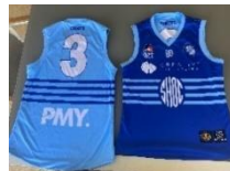
Sacred Heart OC